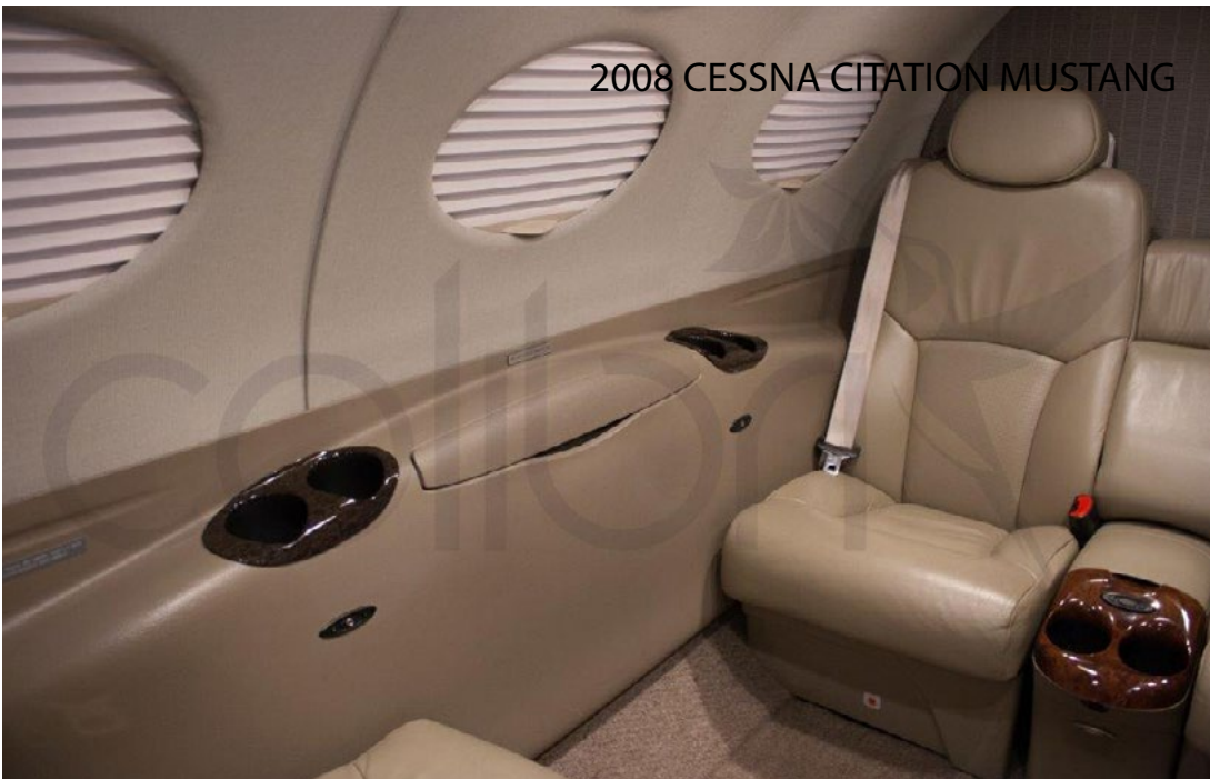
2008 CESSNA CITATION MUSTANG