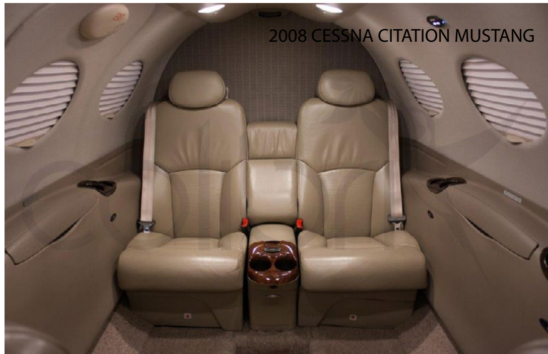
2008 CESSNA CITATION MUSTANG